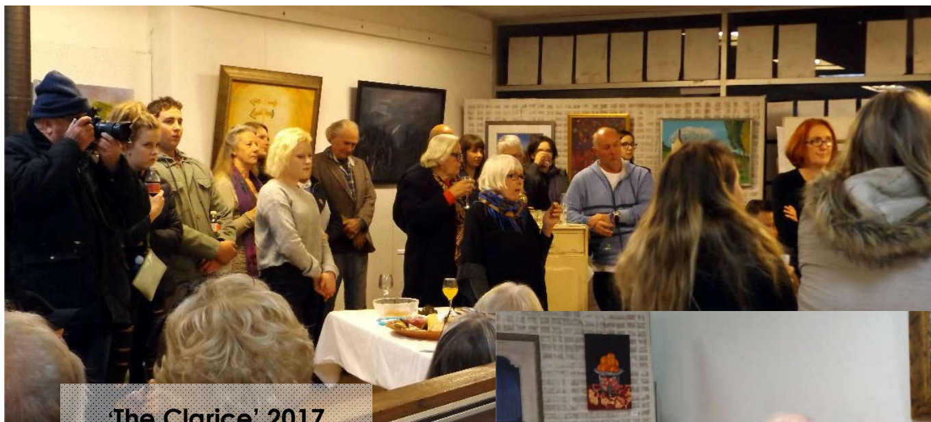
'The Clarice' 2017