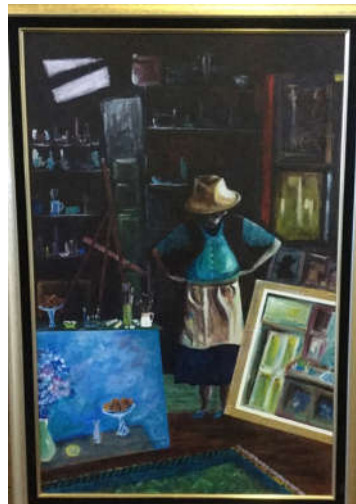
First up for 2018 in January was Collin Tenney's work, his range of styles drawing plenty of interest. (This painting took out Best Acrylic at Peshurst Art Show.)