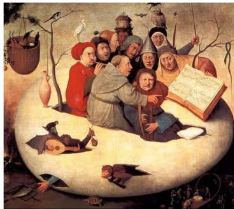
New life from an old egg ( The Concert in the Egg , Hieronymus Bosch)

The upcoming Small Works Challenge gives me pause. How much justice can I do to a work done by a Master? Do I dare? Can I bring new life into something by copying work done by someone long dead? What lit his passion? Can I tap into my own, without causing distressing grave-spinning for the poor departed artist? That, more than the size is the challenge.